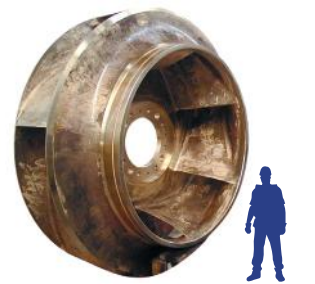
▲ Pump impeller Ø 4000